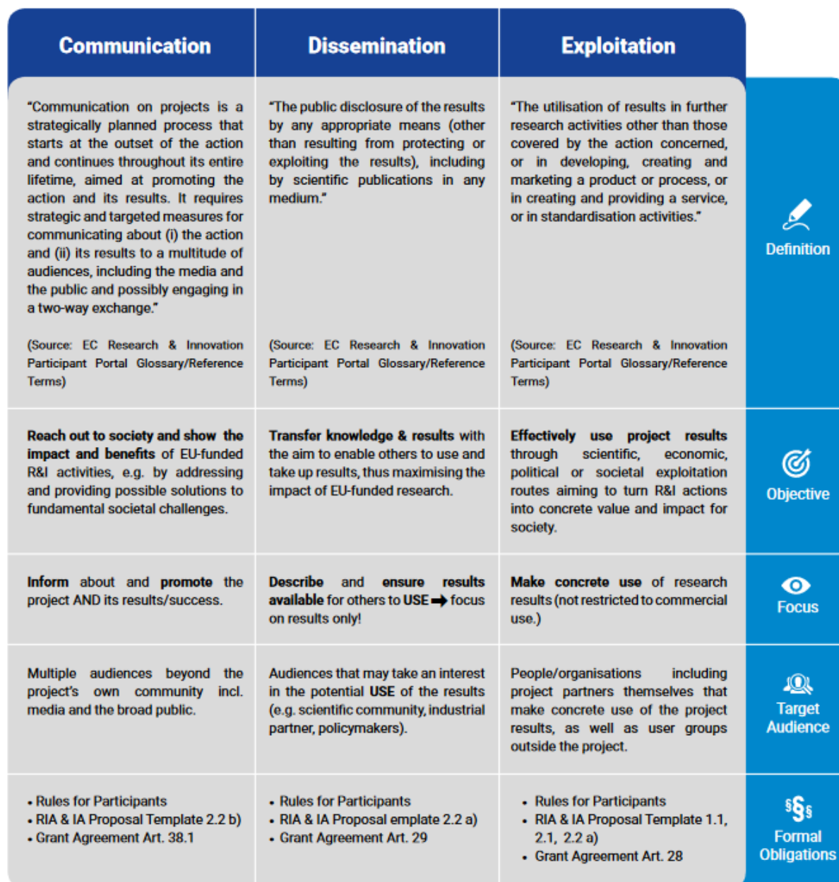
Figure 1 – Communication/Dissemination/Exploitation definitions and distinctions [2]

The definitions and distinctions between the terms communication, dissemination and exploitation of results are given in Figure 1 Communication/Dissemination/Exploitation definitions and distinctions , as presented in the European IPR helpdesk publication [2].