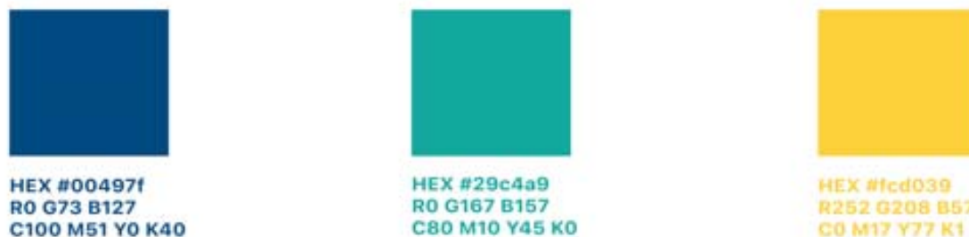
Figure 5 – RadoNorm basic colours