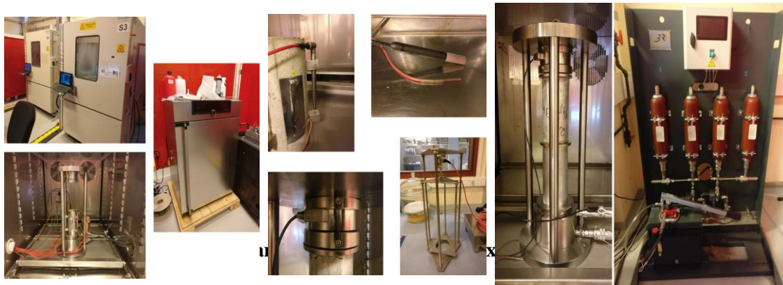
Figure 3: Drying, shrinkage and creep experimental devices in temperature up to 90°C

Transient creep occurs when the temperature is raised from 20°C to 70°C or 90°C for loaded samples (cylinder specimen or prestress beam under flexure) before this heating. Furthermore, its intensity depends on the water content of the concrete at the time of heating. The work is therefore directed towards the evaluation of this transient deformation at LOCA conditions and towards an improvement of the behaviour models to take it into account.